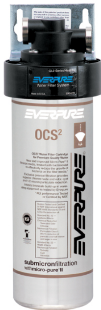
QL2-OCS 2 System: EV9275-60

Delivers premium quality water for office coffee applications