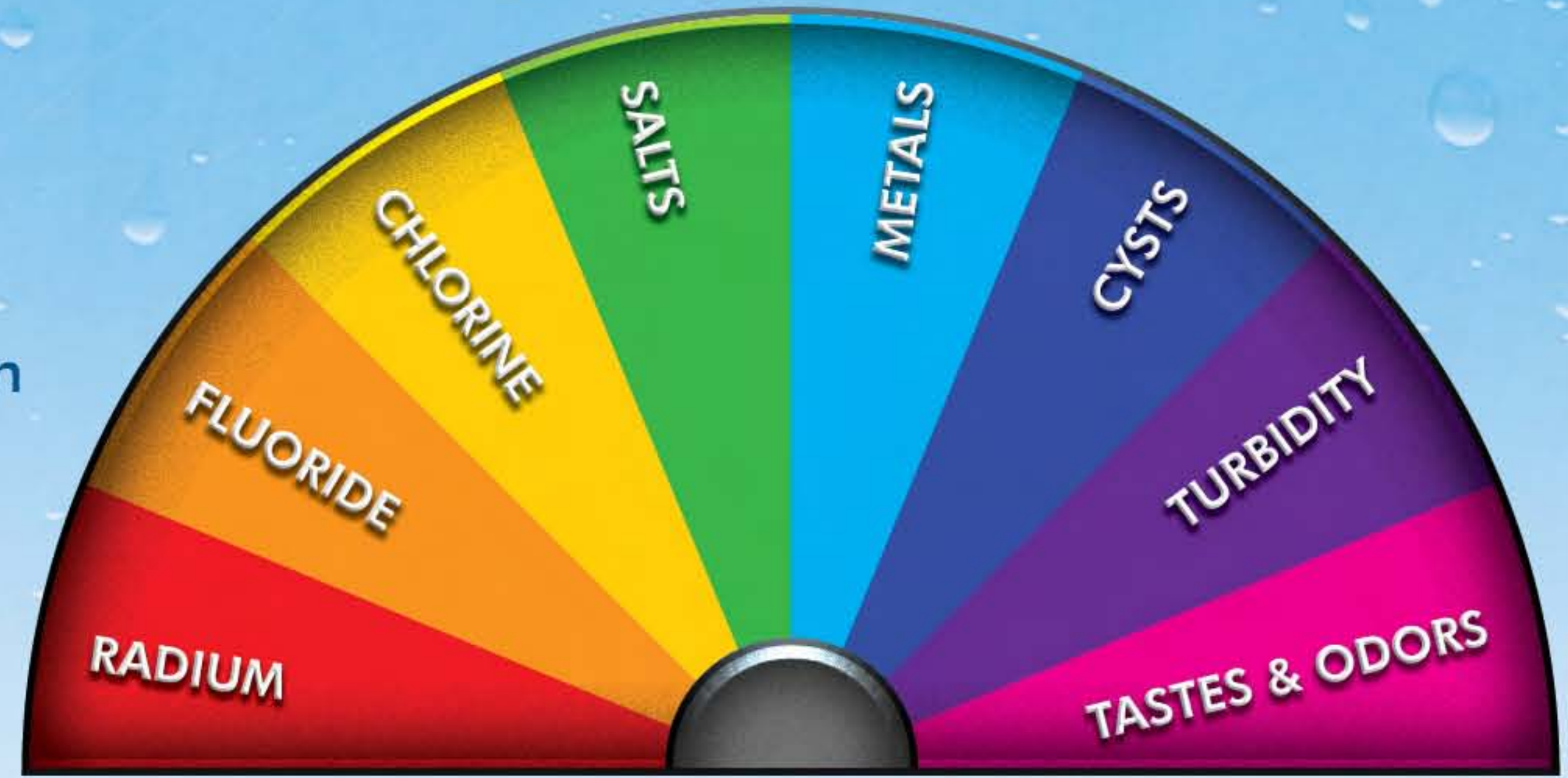
Reverse osmosis systems remove the entire spectrum of harmful contaminants.

Reverse Osmosis (RO) drinking water systems include mechanical filtration to remove particles, carbon absorption and absorption to remove chlorine, taste, odor and chemical contaminants, as well as membrane separation down to .0001 microns. RO membranes remove dissolved solids at the ionic level. No other purification system can provide better removal. Reverse Osmosis Systems provide the best quality drinking water for your family.