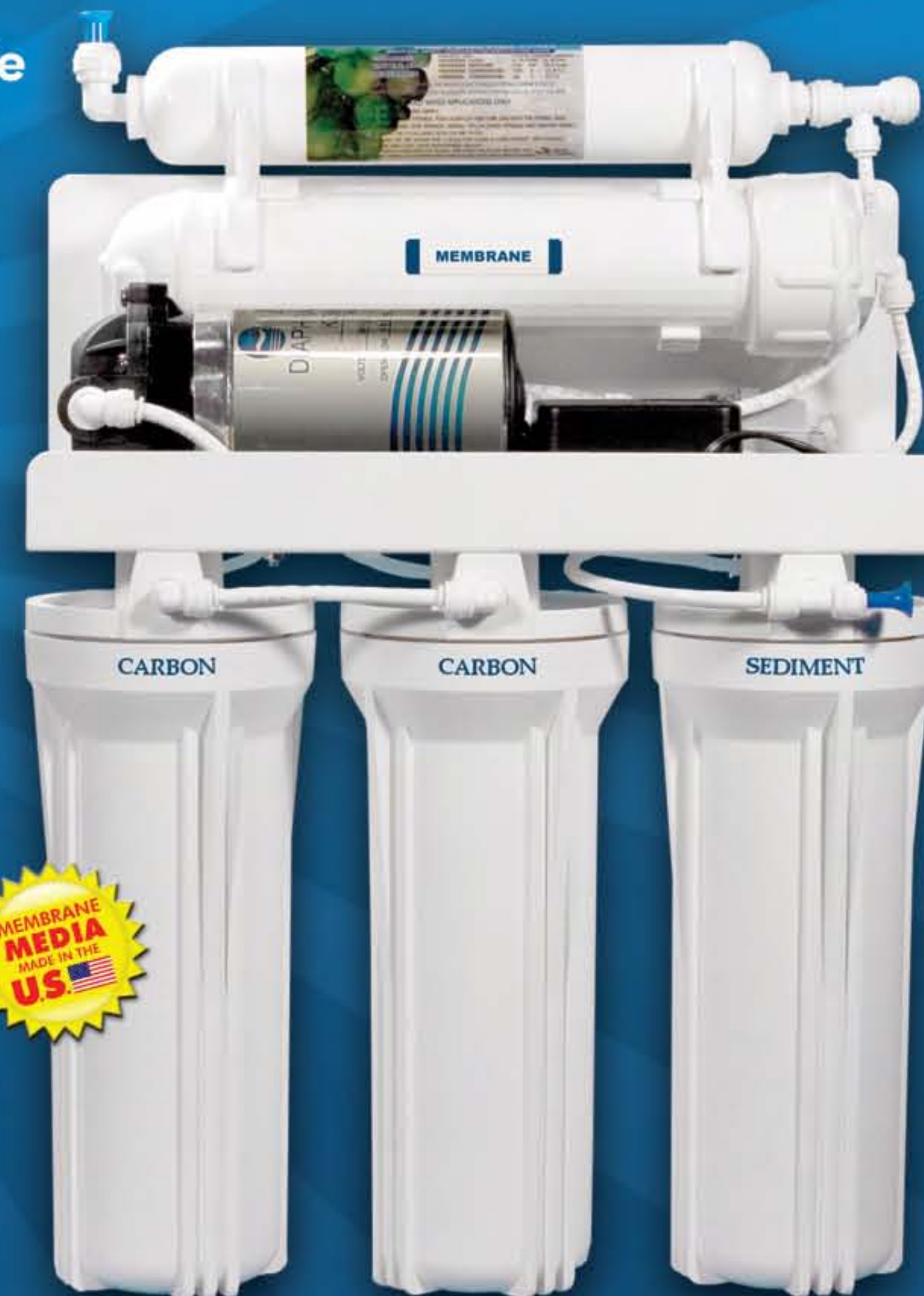
5 STAGE RO SYSTEM WITH LOW PRESSURE BOOSTER PUMP