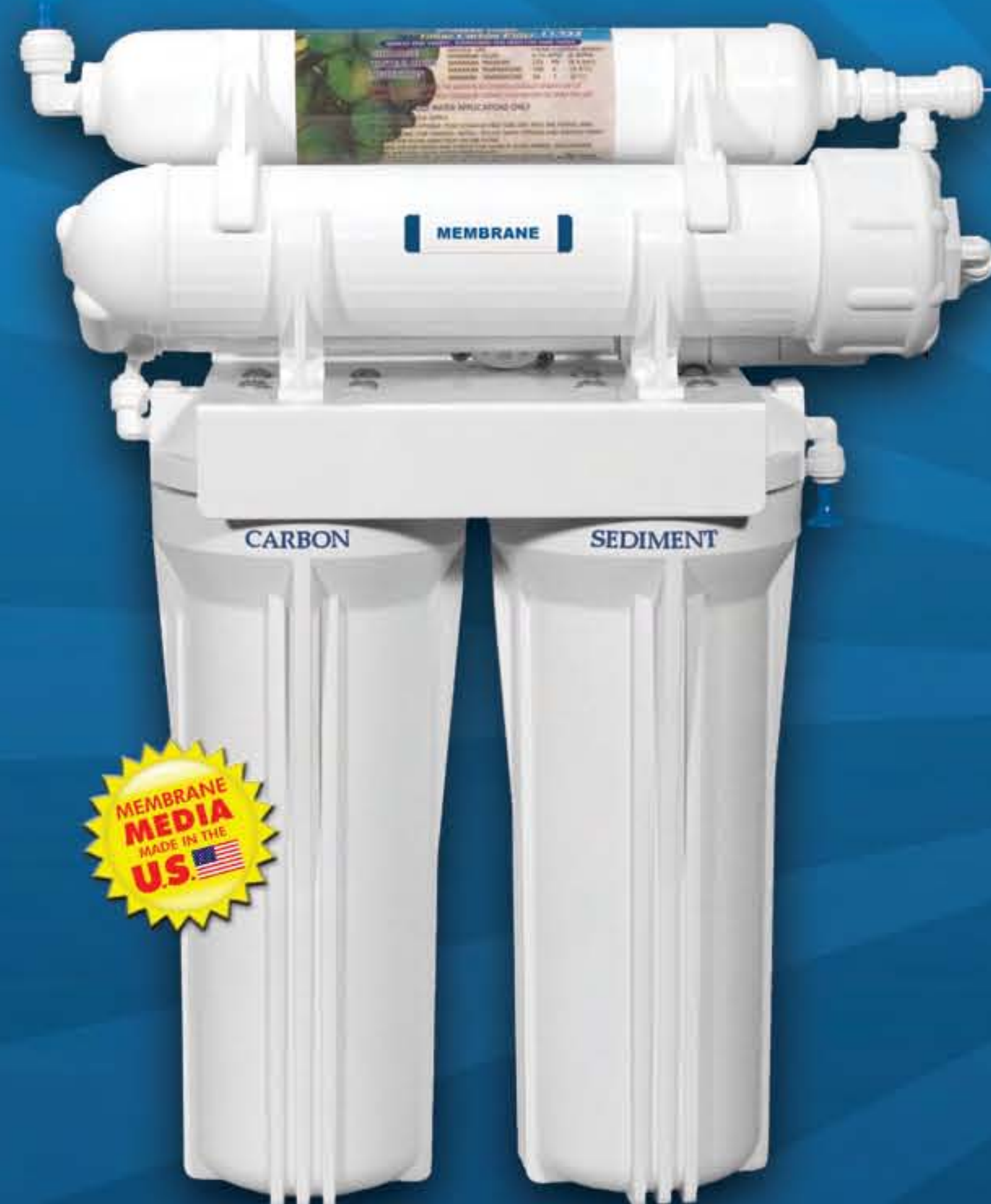
4 STAGE RO SYSTEM WITH TFC MEMBRANE

Reverse Osmosis Systems are intended for use on water that is Microbiologically Safe