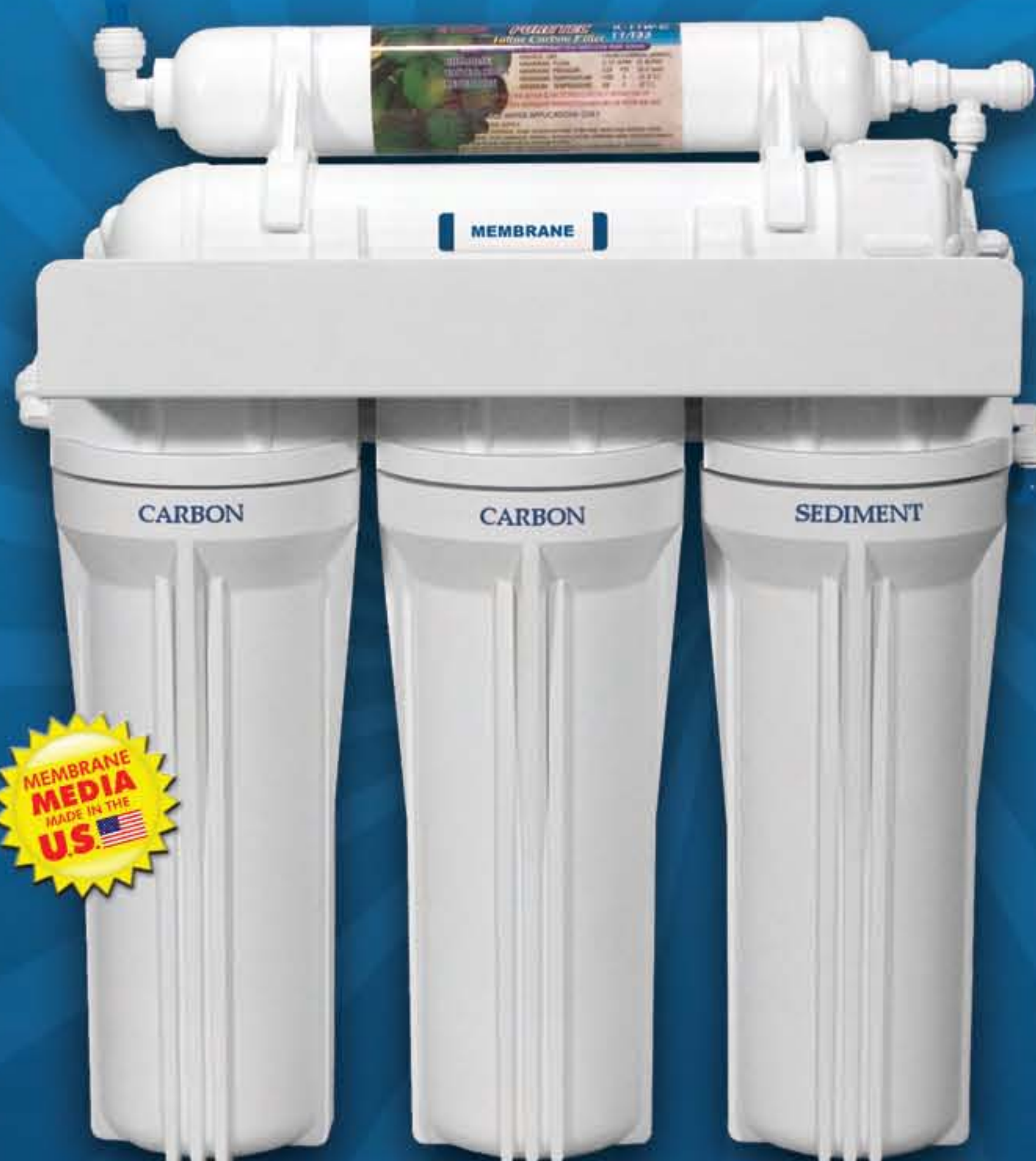
5 STAGE RO SYSTEM WITH TFC MEMBRANE